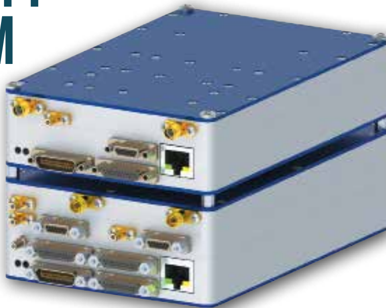
1 // The LS-96-M2 Data Re-Transmission System

The LS-96-M2 can be placed locally on the flight line and will receive the preflight telemetry, and process it down to clock/data outputs. These clock and data signals are fed to the LS-28-DRSM's onboard dynamic IF modulator, where the data can be modulated to one of many formats. The modulated output, necessarily at the same data rate, is then fed to the input of the upconverter module of the LS-96-M2, where it is first split into two streams and then unconverted to RF. The LS-96-M2 allows for upconversion from 200MHz to 7GHz at a power output of up to +20dBm. The output from each unconverted channel can be fed to a typical high-gain directional transmit antenna that is placed